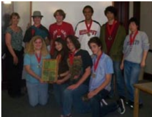
San Dieguito High School 2008 Coast Division Junior Varsity Champion

The San Dieguito Academy's Mustang Minds' Junior Varsity Team were the Coast Division Champions in 2008 and 2007. Additionally, SDA's Junior Varsity Team was the 2007 N.C.A.L. Champions!