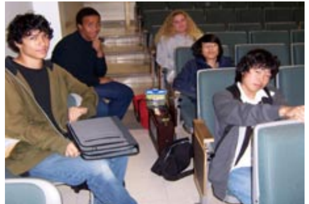
SDA's Quiz Bowl Varsity Team after placing 2nd at UC-Irvine.